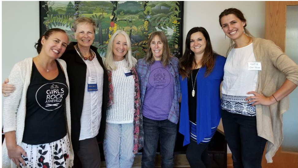
WFW members with panelists from a Brown Bag Lunch and Learn, sponsored by the Advocacy & Education Committee