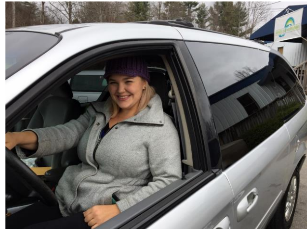
2016 WFW grantee, Working Wheels, connected women referred by Helpmate with reliable cars